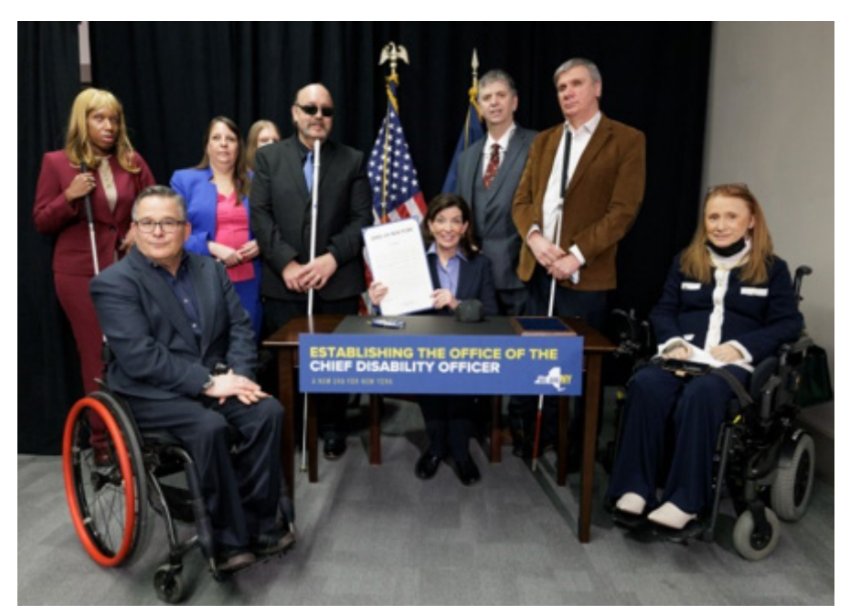
Signing of legislation creating the office for the Chief Disability Officer.